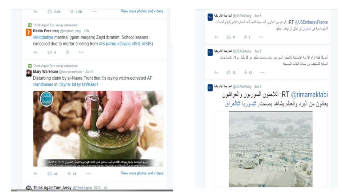
#ThinkAgainTurnAway: In English and Arabic.

The government can rely on videos to counter IS' claims and return IS a dose of its own medicine. The videos should look professionally shot to give viewers a sense of credibility and authority, just as IS had done. They should project the tussle of emotions that fighters or recruits will face at war to depict their human side, rather than projecting them as one-sided ruthless animals, or brainwashed emotionless fanatics. This is more realistic and more likely to appeal to misguided or confused individuals toying with the idea of joining IS. The videos should be released not only on Youtube, but also websites that attract IS-inclined user traffic. Furthermore, the UK government can collaborate with private firms to produce films, television programs and various other broadcasting options to capture a wide audience. The movement should be centralised and national, and constantly talked about to be successfully embedded in citizens' minds.